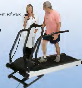
Stress Test upgradeable